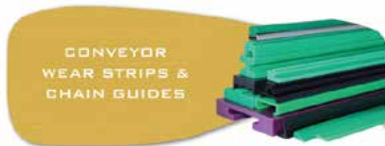
Chain Guides and Wear Strips