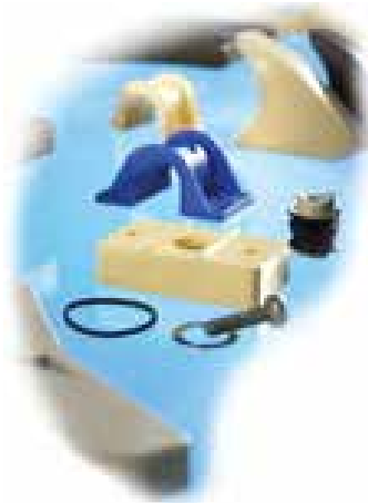
Bottle Washer Spares