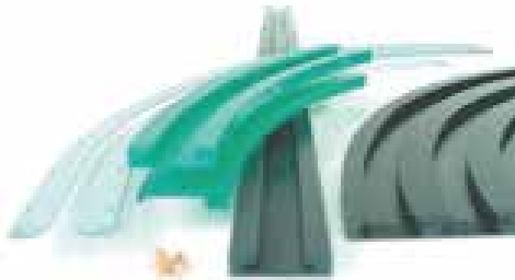
Corner and Straight Tracks